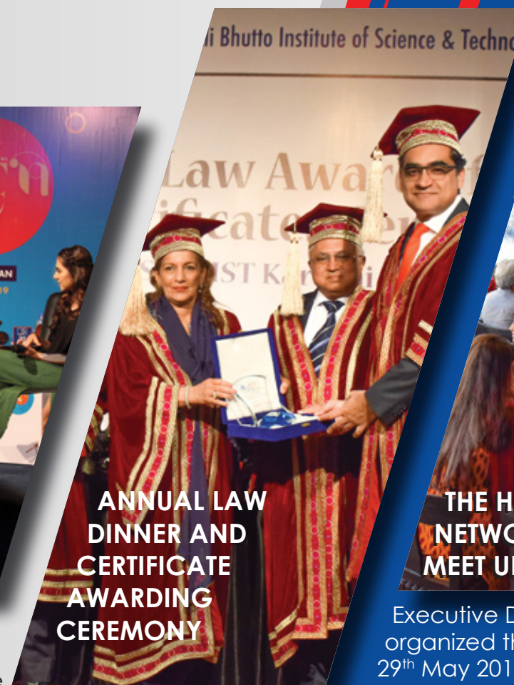
ANNUAL LAW DINNER AND CERTIFICATE AWARDING CEREMONY