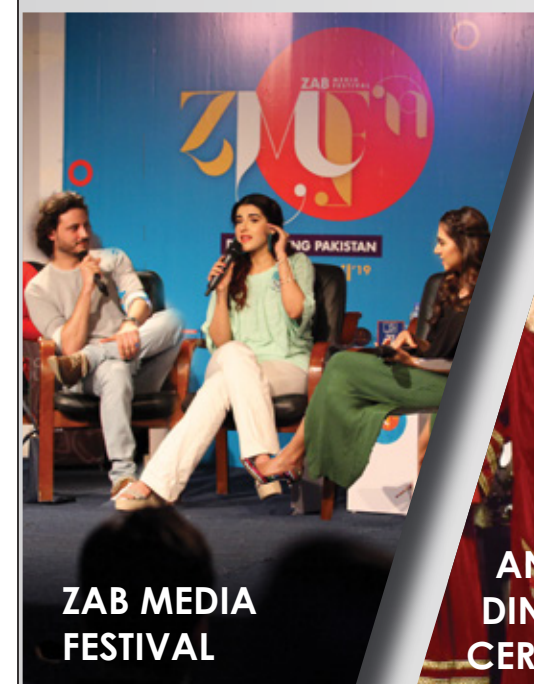
ZAB MEDIA FESTIVAL