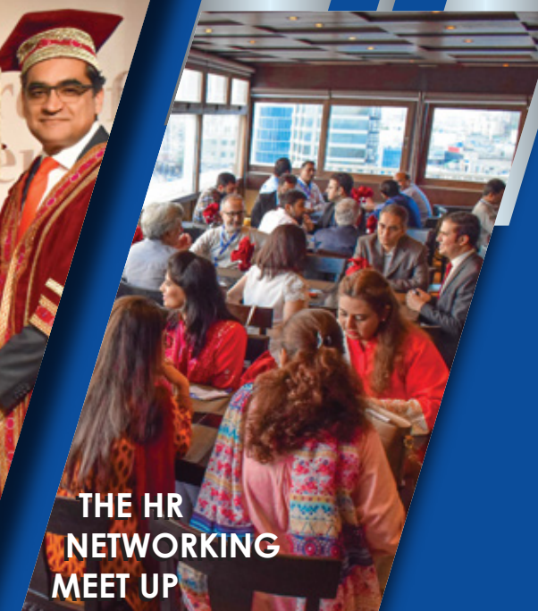
THE HR NETWORKING MEET UP

SZABIST celebrated treasure trove of media in Pakistan via films, documentary, design and photography based on the theme of 'Discovering Pakistan' from 2 nd April to 6 th April 2019. Prominent names such as Madam Sultana Siddiqui, Tina Sani, Osman Khalid Butt, Hareem Farooq, Mansha Pasha, Ali Rehman Khan and Ali Gul Pir shared their experiences.