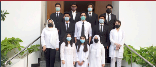
SZABIST Law Society

One of the key players in this respect is SZABIST's Executive Development Centre (EDC). The EDC organizes yearly career fairs to enable students to interact with prospective employers which include leading multi-national companies and gain job opportunities. Law students are afforded opportunities to be employed in the legal departments of such corporations.