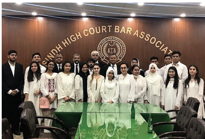
Annual Visit to High Court

We also provide support to students through our Teaching Assistants. Our TAs conduct interactive tutorials primarily aimed at trouble shooting students' problems as well as guiding them on study methods and exam preparedness.