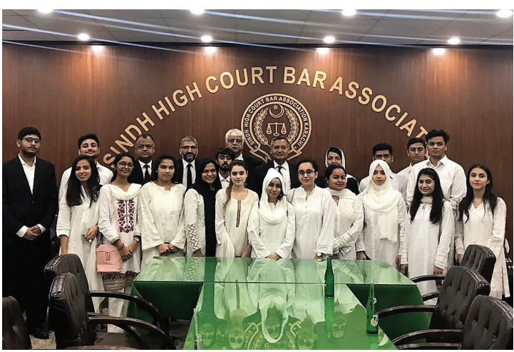
Annual Visit to High Court

We also provide support to students through our Teaching Assistants. Our TAs conduct interactive tutorials primarily aimed at trouble shooting students' problems as well as quiding them on study methods and exam preparedness.