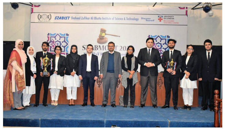
Winners of Annual SZABMoot Competition

Additionally, SRLC invests in multiple alternative dispute resolution mechanism trainings to ensure awareness amongst law students. The SRLC ensures our law students are well receptive to the change in the legal dynamics and are able to perform exceptionally at external national as well as international forums.