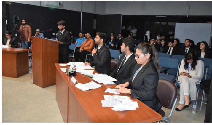
Annual SZABMoot Competition