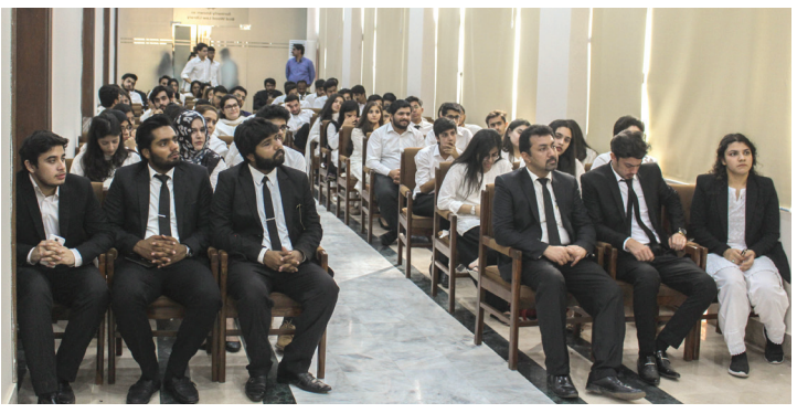
Annual High Court Trip

The Law Society is a student society comprising of undergraduate law students which is run by student representatives. An annual election is held as per the constitution of the SLS for appointment of students to the various offices of President, Vice-President, Treasurer etc. The elected members are responsible for organizing various student related activities in conjunction with the SZABIST Student Council. This not only includes social activities like the Beach Trip but also Guest Speaker sessions, SZABMoot and the annual High Court Trip. The SLS also acts as a liaison between SZABIST and various law firms, which are the prospective employers of the LLB students.